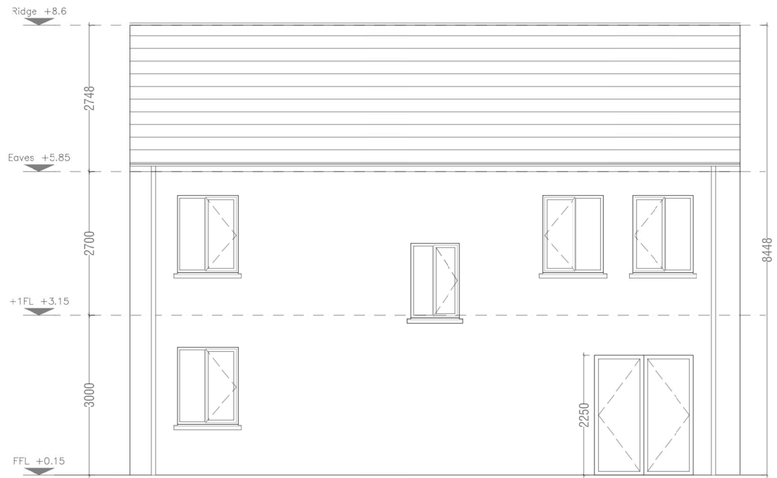
House Type U2 Semi - Detached Rear Elevation