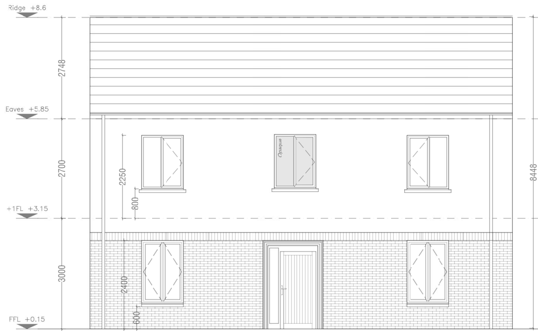
House Type U2 Semi - Detached Front Elevation